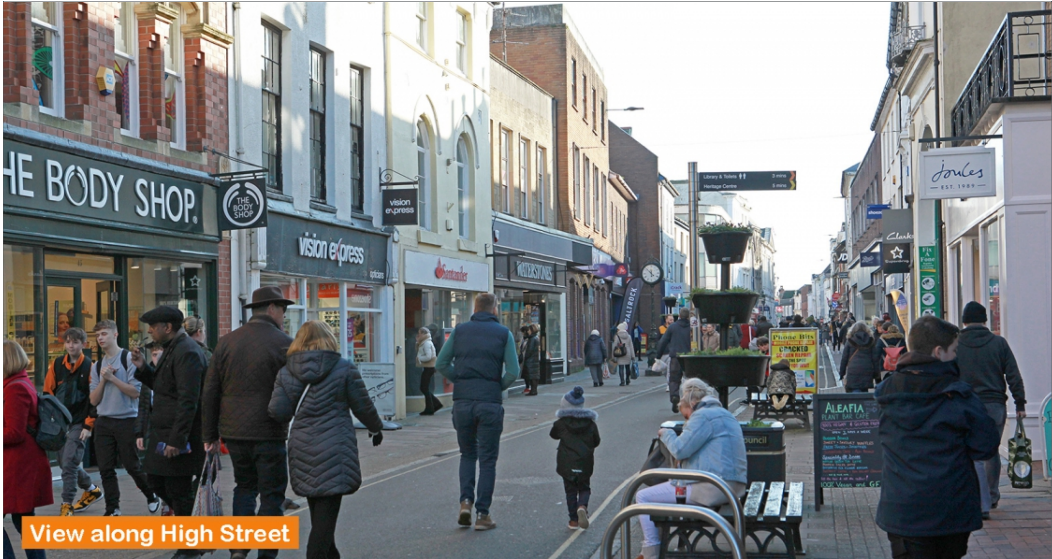
View along High Street

For sale by Auction on 16th February 2023 (unless sold or withdrawn prior)