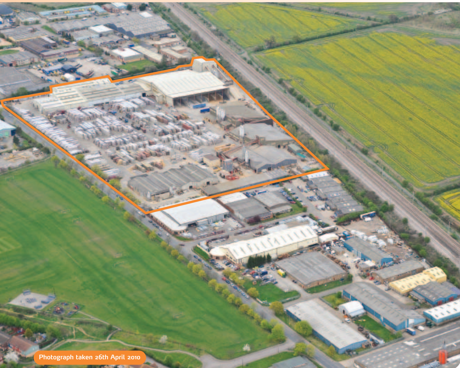
Photograph taken 26th April 2010