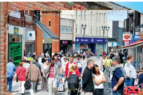
Photographs taken 6th August 2011