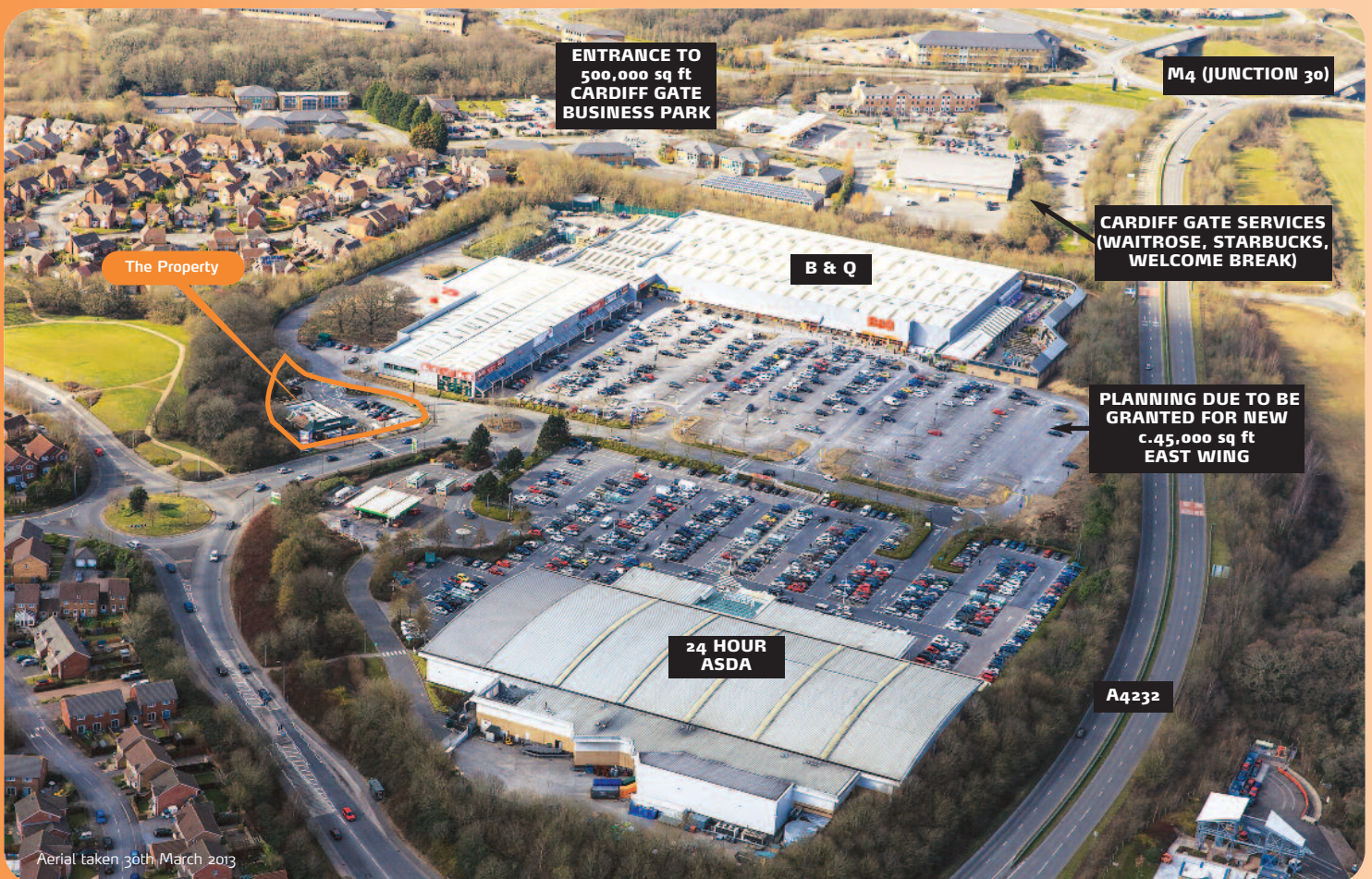
Aerial taken 30th March 2013