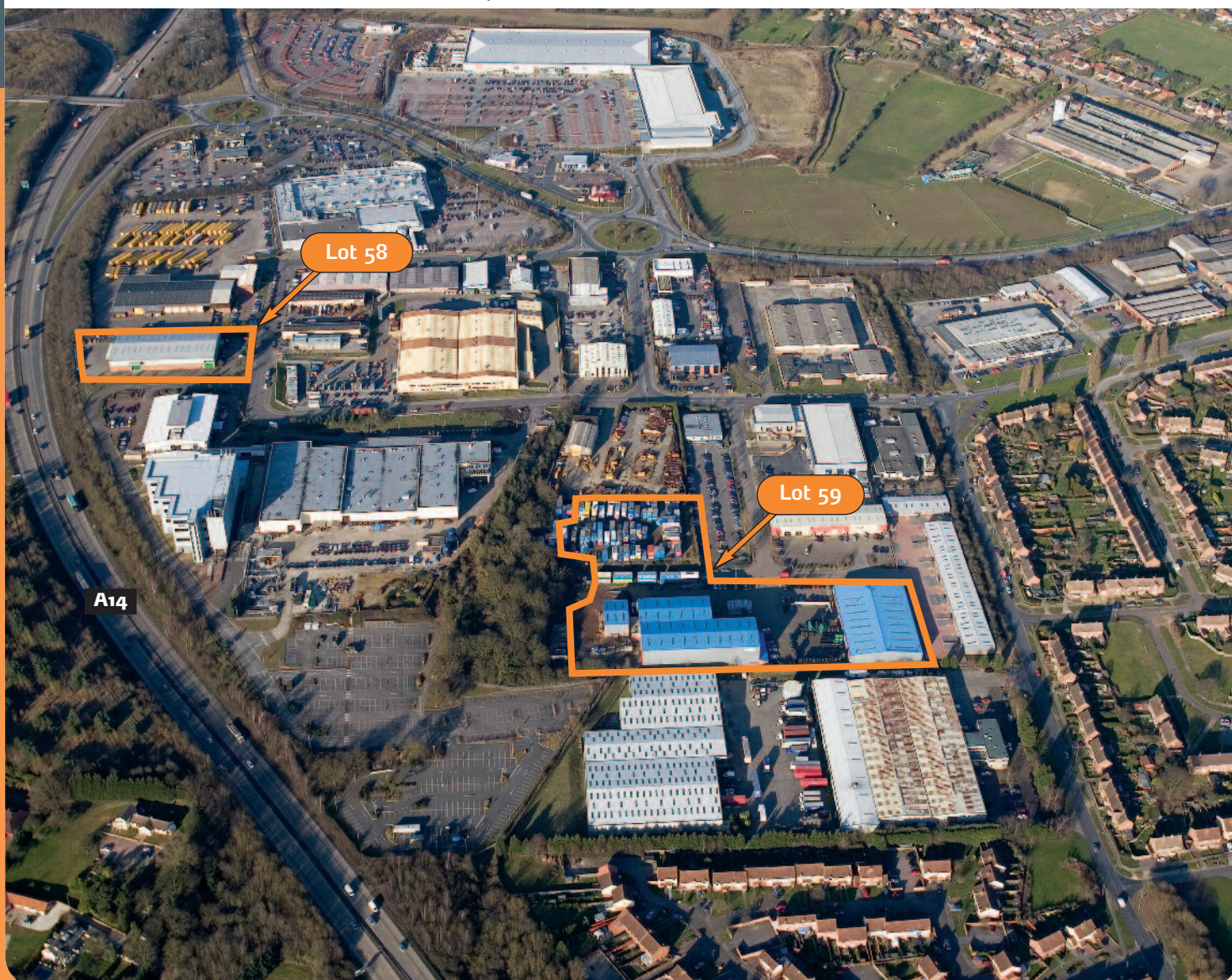
Photograph for identification purposes only.