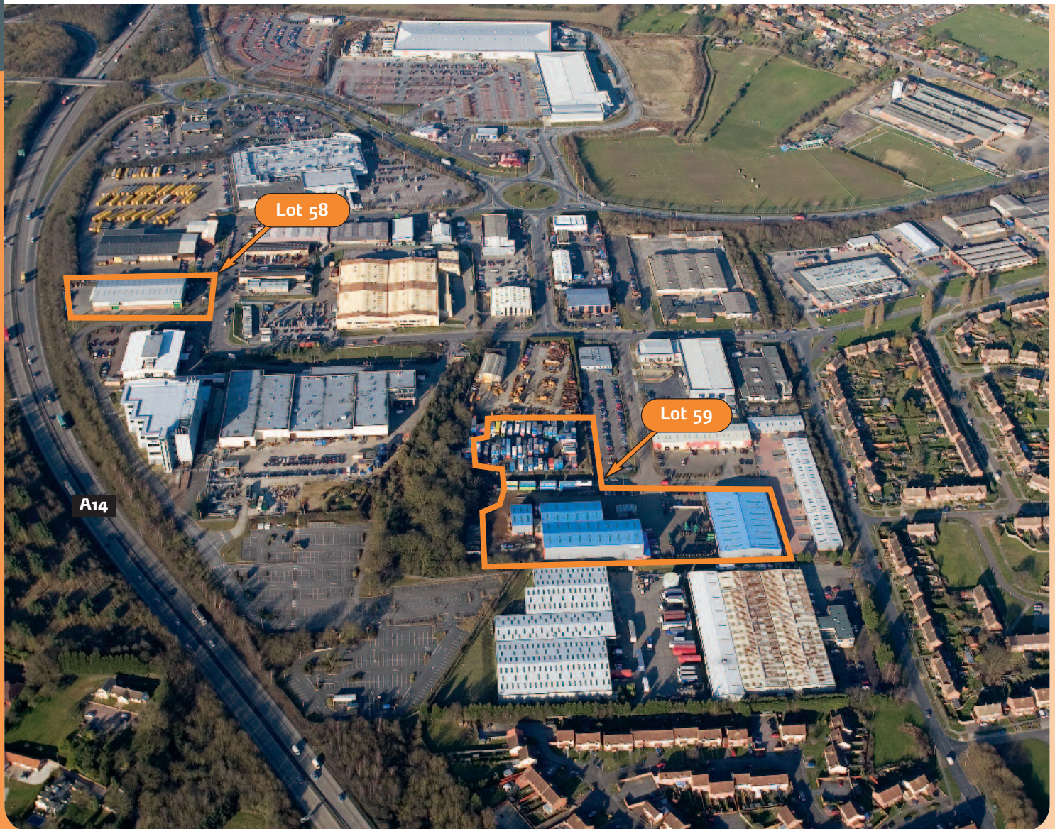
Photograph for identification purposes only.