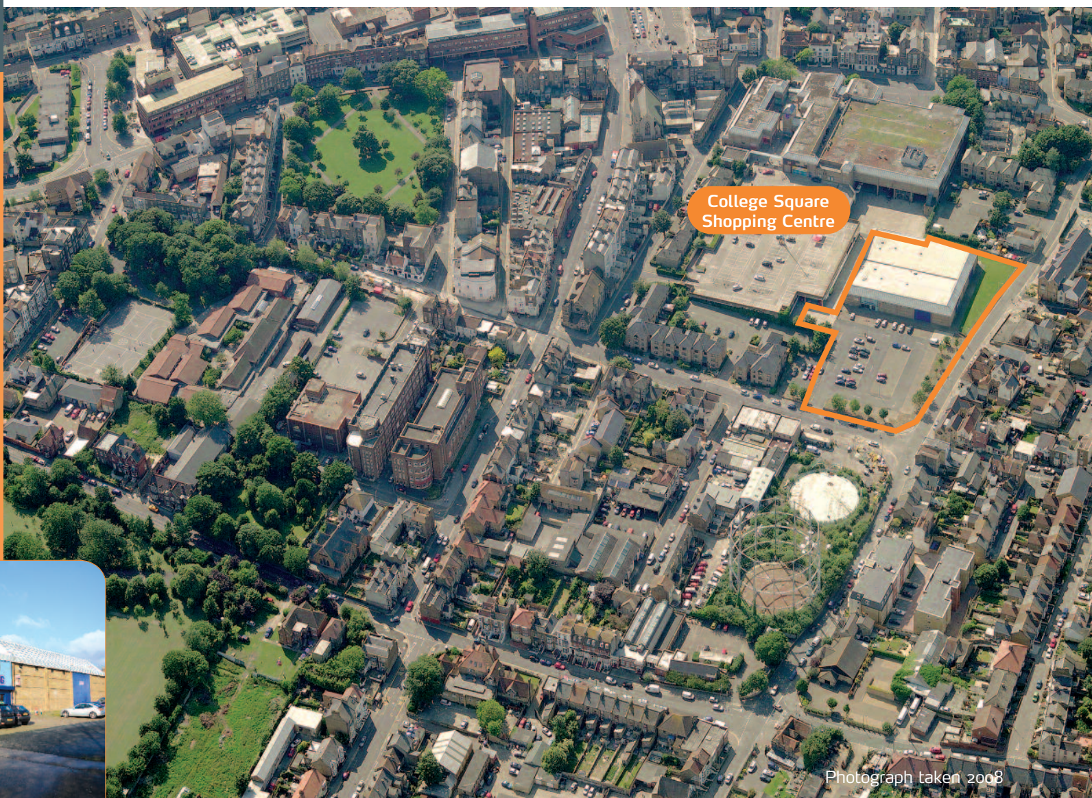
Photograph taken 2008