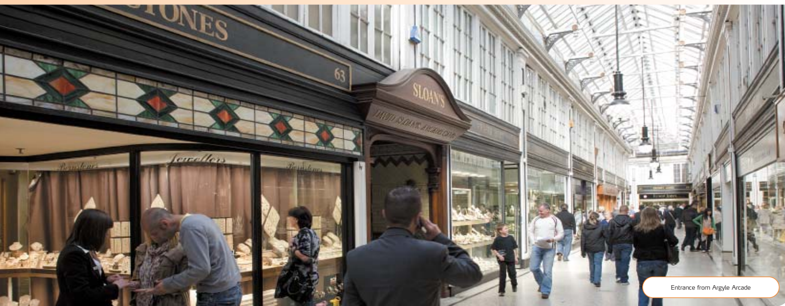
Entrance from Argyle Arcade