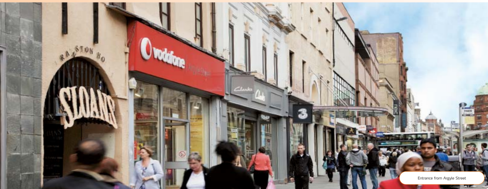
Entrance from Argyle Street