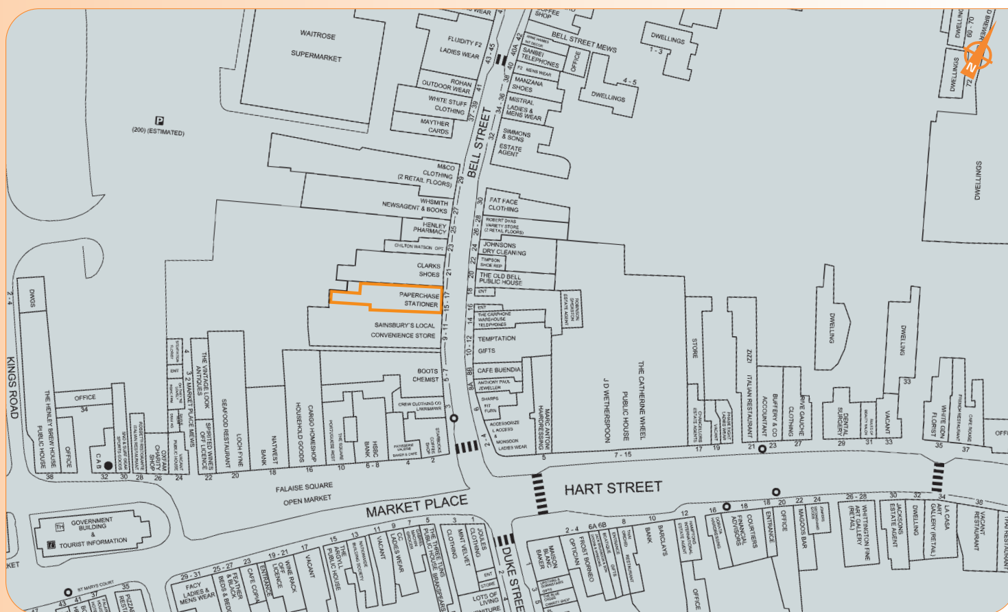
Copyright and confidentiality Experian, 2013. © Crown copyright and database rights 2013 Ordnance Survey 10007316. For identification purposes only.