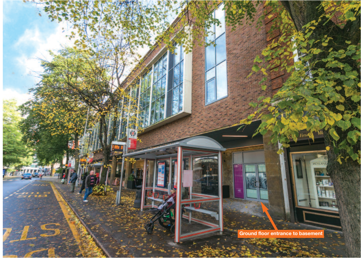
Ground floor entrance to basement